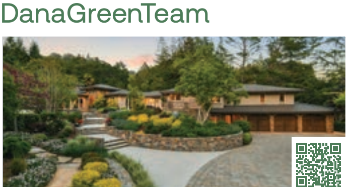
JUST LISTED! 4090 Happy Valley Road, Lafayette 4 Bed | 5.5 Bath | 6390 ± Sq. Ft. Main + Guest House | 2.64 ± Acre Lot Offered at $8,995,000 | LuxuryHappyValleyEstate.com

See public meetings schedule on these pages and check online for agendas, meeting notes and announcements City of Lafayette: www.lovelafayette.org Phone: (925) 284-1968 Chamber of Commerce: www.lafayettechamber.org