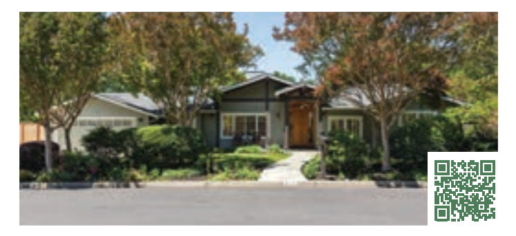
JUST LISTED! 218 Contessa Court, Lafayette 5 Bed | 4 Bath | 3136± Sq. Ft. | .33± Acre Lot Offered at $3,295,000 | 218ContessaCourt.Com

Lafayette's #1 Real Estate Team Since 2008